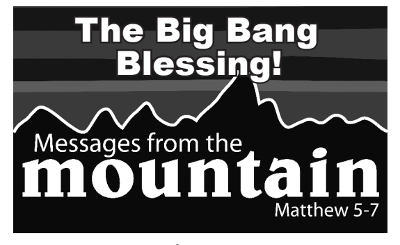
April 10, 2013

"Ask and it will be given to you; seek and you will find; knock and the door will be opened to you. For everyone who asks receives; he who seeks finds; and to him who knocks, the door will be opened. Which of you, if his son asks for bread, will give him a stone? Or if he asks for a fish, will give him a snake? If you, then, though you are evil, know how to give good gifts to your children, how much more will your Father in Heaven give good gifts to those who ask Him! So in everything, do to others what you would have them do to you, for this sums up the Law and the Prophets.